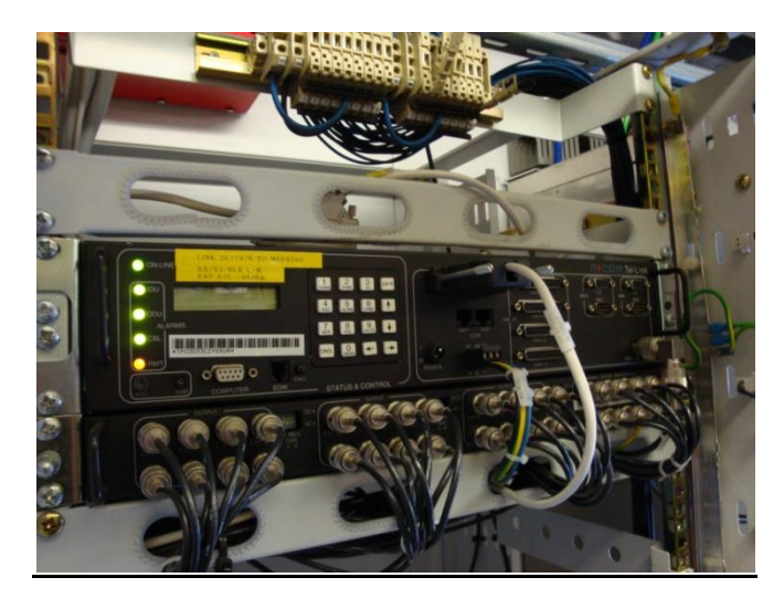
Figure 2: PCOM IDU, frequency independent IDU with 16 x 2Mbps ports (tribs) - split mount systems (IDU/ODU) (mid 1990s)