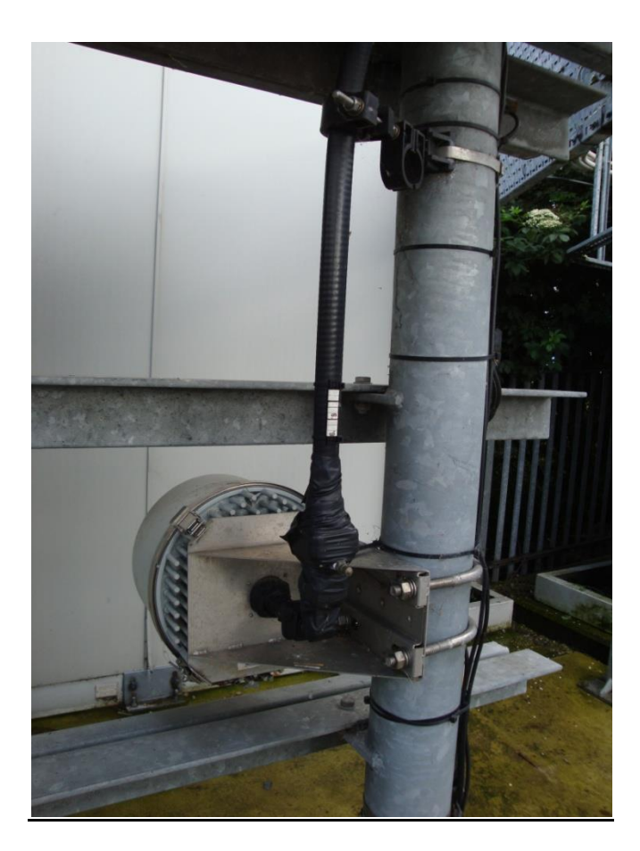
Figure 3: PCOM ODU, 13GHz ODU - split mount systems (IDU/ODU), with waveguide between ODU and antenna (mid 1990s)