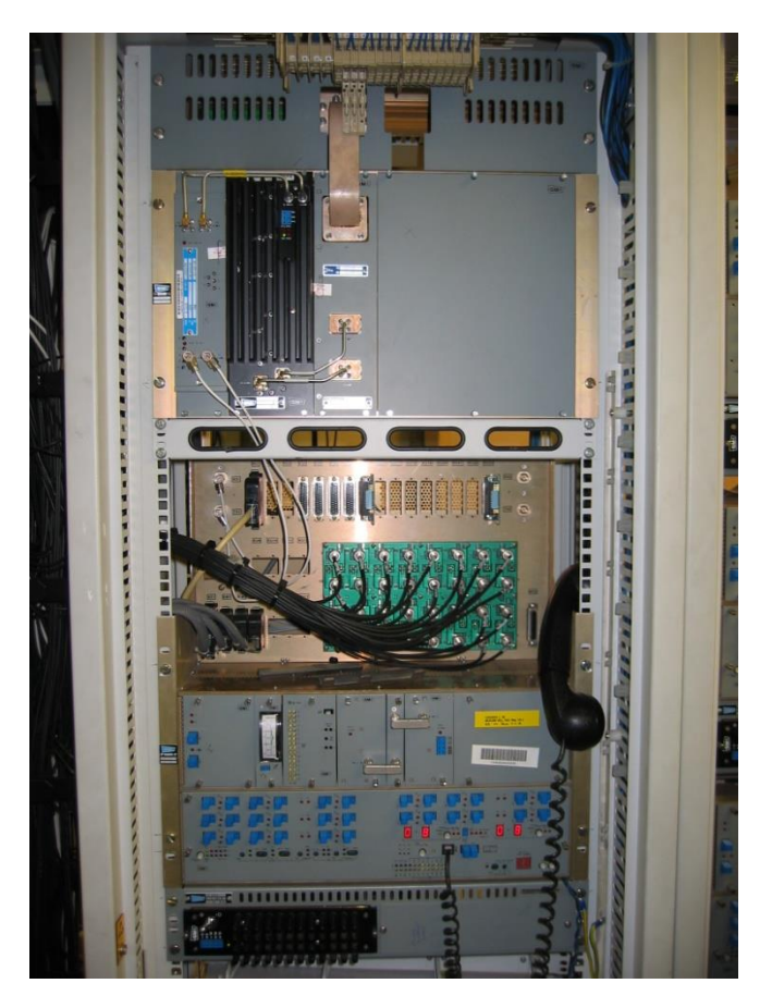
Figure 1: Siae 7.5GHz 16 x 2Mbps digital microwave radio system - all indoor solution (late 1980s)

the equipment shelter), it could be mounted on the tower behind the antenna or, as is increasingly common, directly mounted to the back of the antenna as an integrated system. Antennas themselves have evolved too, from horns to parabolic dishes with ever increasing amounts of sophistication and performance.