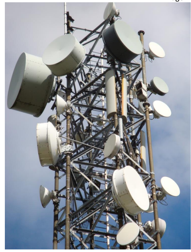
Figure 6: Microwave radio tower with cellular antennas and a large quantity of class 3 antennas